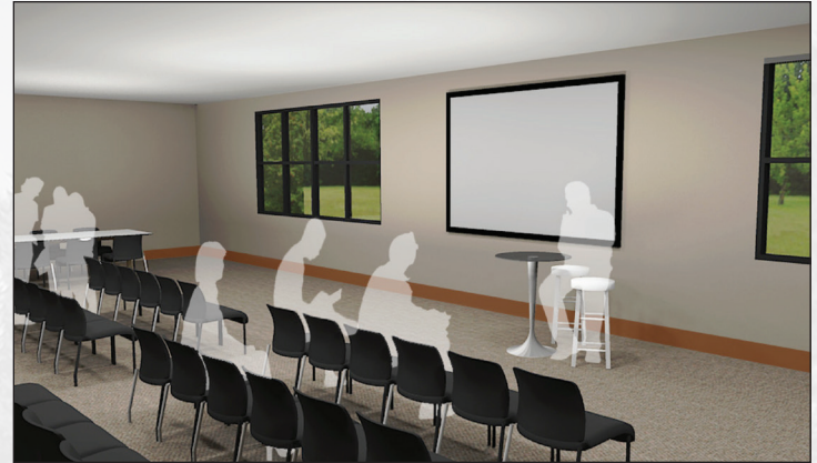
UPSTAIRS CLASS/MEETING ROOM (CONCEPTUAL)