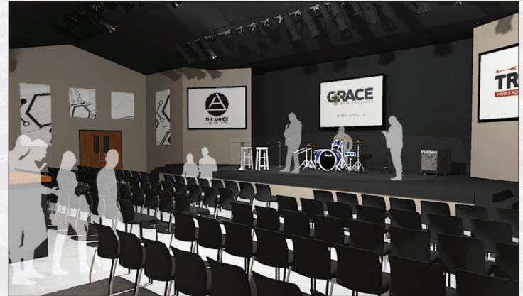
SMALL AUDITORIUM (CONCEPTUAL)