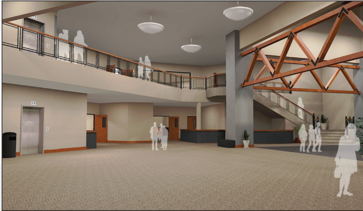
INTERIOR ATRIUM (CONCEPTUAL)