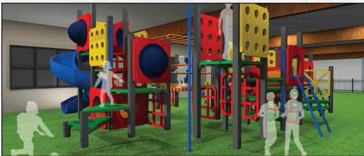
EXTERIOR PLAY AREA (CONCEPTUAL)