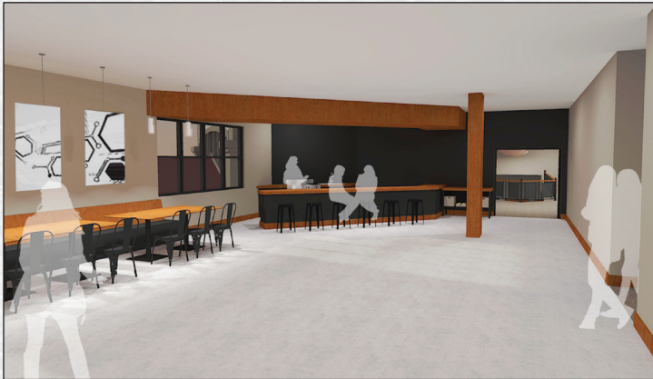
GATHERING AREA (CONCEPTUAL)