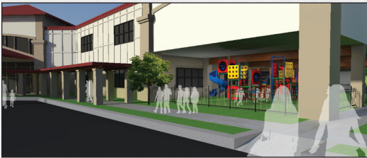
EXTERIOR PLAY AREA (CONCEPTUAL)